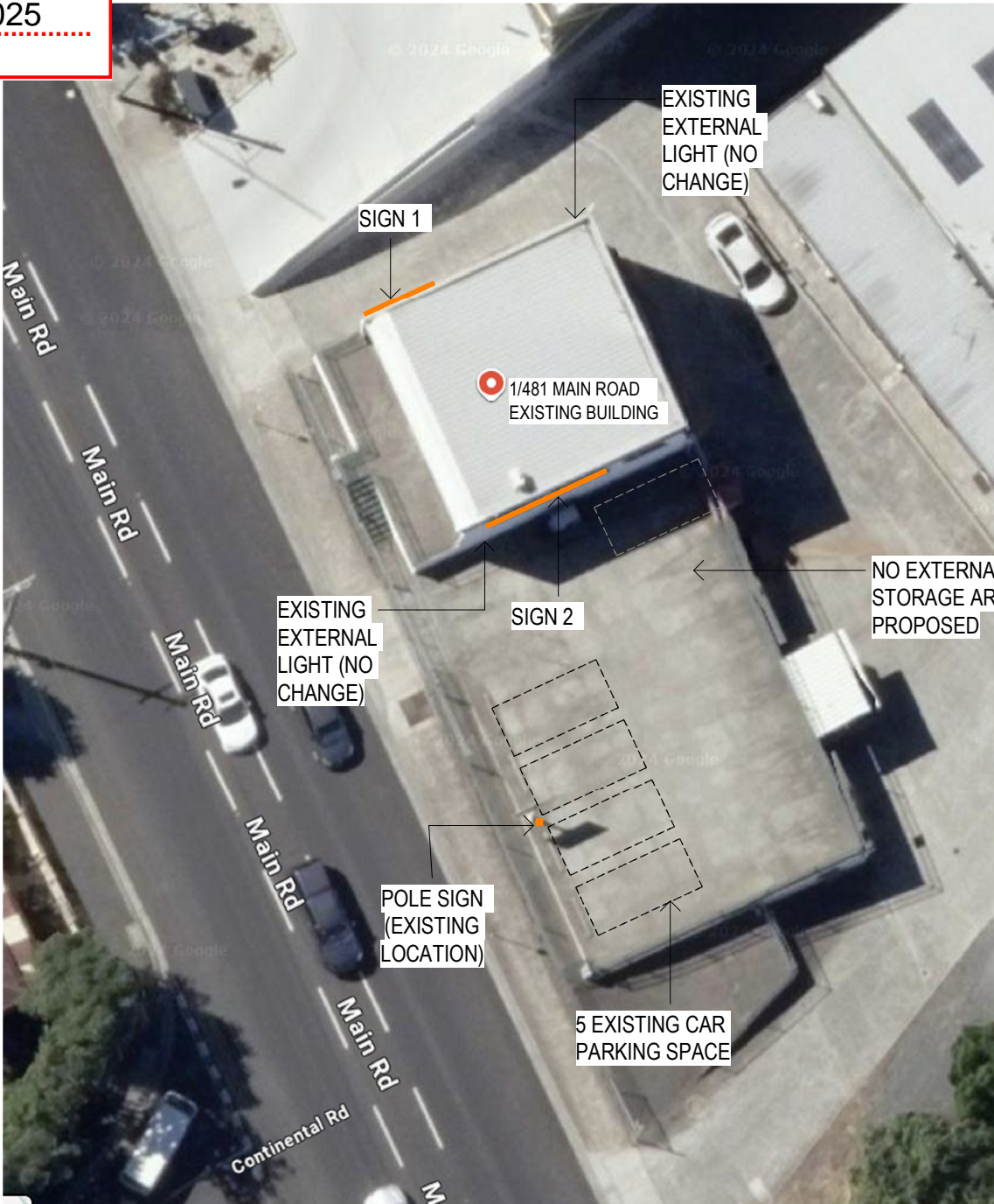
2 NEW SIGNS LOCATION Scale 1 : 30