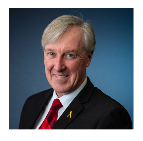
DIRECTOR COMMUNITY AND CUSTOMER SERVICES