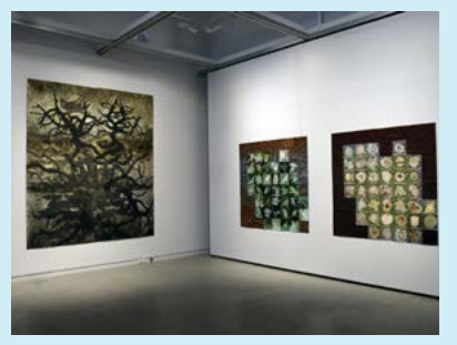
Image credit: Forest Obscura 2021, Yvonne Rees-Pagh (left) and Milan Milojevic (right)

Are you an artist, maker or creative? Would you like to show your art at Moonah Arts Centre? Applications are now open for exhibitions in 2023. Visit moonahartscentre.org.au/ apply for more details.