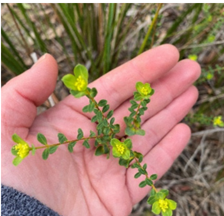
Left flowers beginning to bloom on the threatened yellow rice flower. Right threatened spur velleia.

To view the strategy please visit our website www.gcc.tas.gov.au