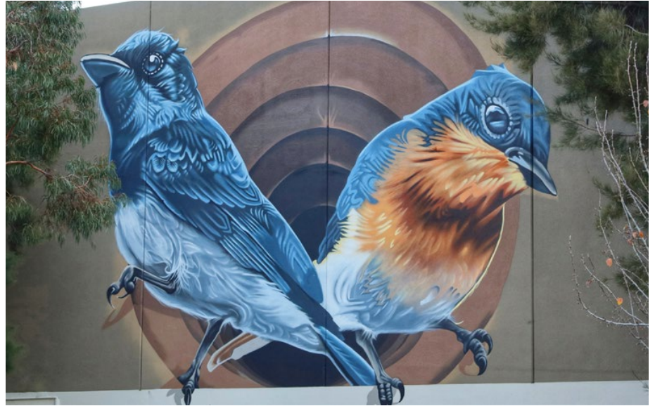
Art mural on the side of Northgate by artist Jamin.

Artists were selected through an open-call process, with over 70 artists applying for the opportunity. The final