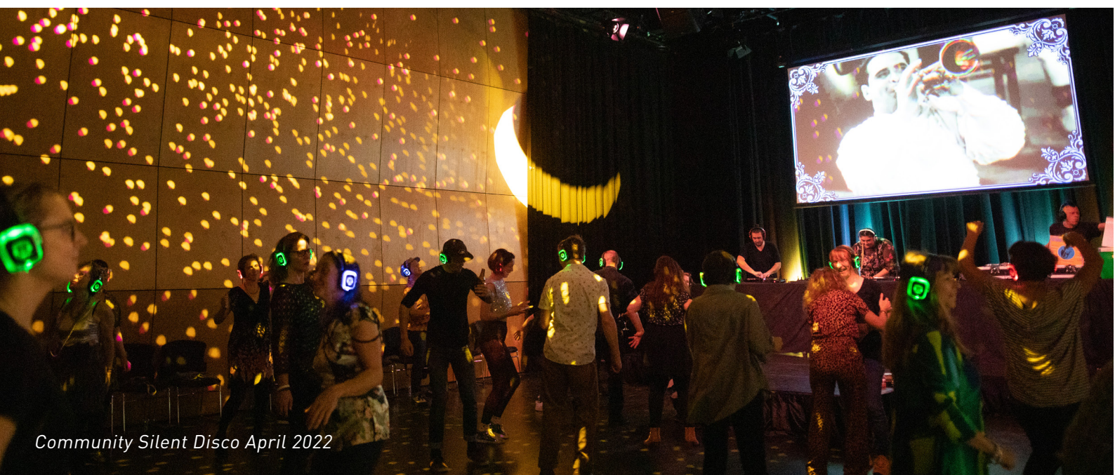
Community Silent Disco April 2022