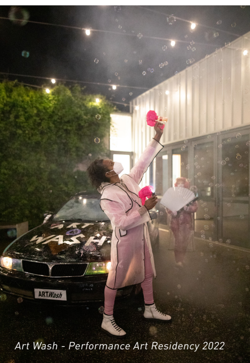
Art Wash - Performance Art Residency 2022

Hire - $202.60 per day. Subsidised rates available for Art Organisations and Community Groups and weekly hires.