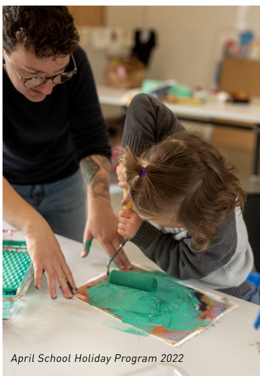
April School Holiday Program 2022