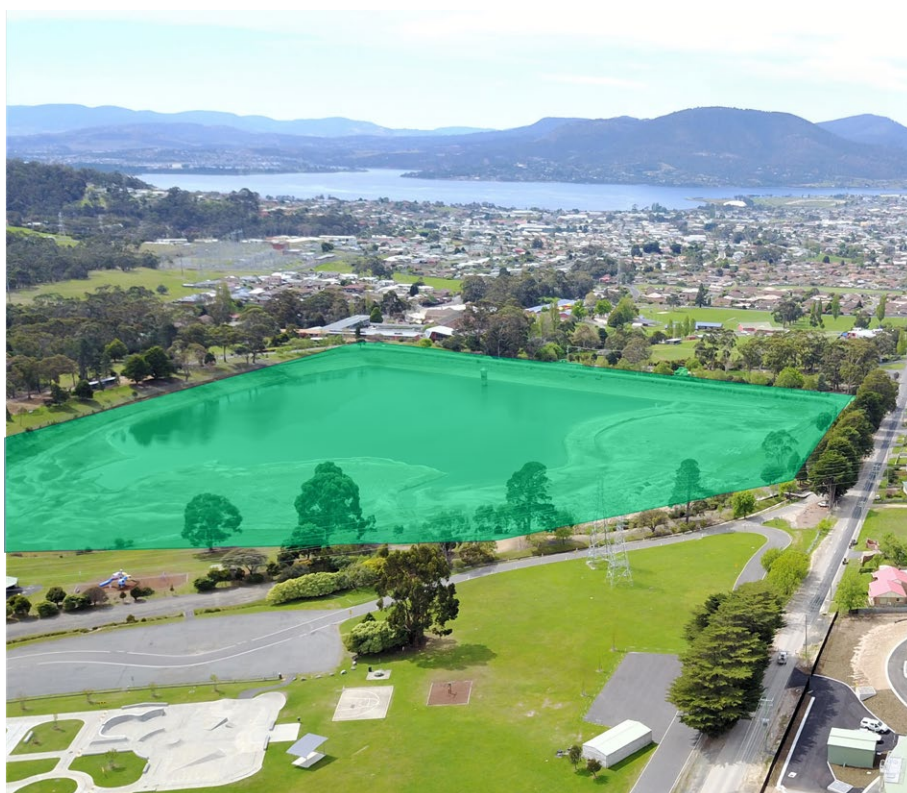
Image: Tolosa Park Masterplan Area (Decommissioned Tolosa Reservoir).

Funding for the implementation of the masterplan would allow the Council to continue and complete the area's transformation through phase two of the project, capitalising on its location as a gateway to both Wellington Park and the Glenorchy Mountain Bike Park, ensuring it serves as a valued nature-