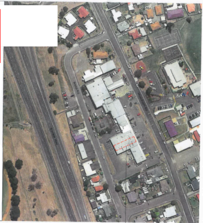
Proposed shop fit-out at 24C 24C Wyndham Road, Claremont

GENERAL NOTES: Contractor shall verify all dimensions and levels on site before commencement of any work. Contractor shall notify any discrepancies before commencement of any work. Drawings must not be scaled. Contractor shall submit samples and shop drawings before commencing work. All work shall be carried out in accordance with the Building Code of Australia and all relevant Australian Standards. These designs, plans, specifications and the copyright herein are the property of Oramatis Studio and must not be used, reproduced or copied wholly or in part without the written permission of Oramatis Studio.