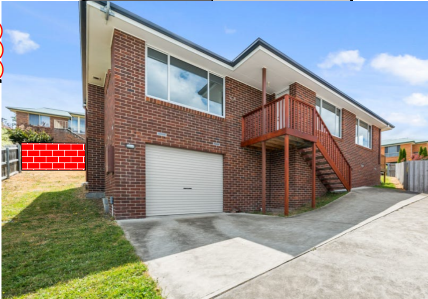
AREA OF PROPERTY WHERE FSL IS >1000MM FROM NGL (MAX HEIGHT 1100MM)

4a Taree Street, Chigwell PLANNING PLAN SET_REV 0 CLIENT: ZAC DERRICK & AMBER ALLEN