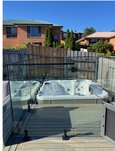
POOL FENCING TO HOT TUB PERIMETER