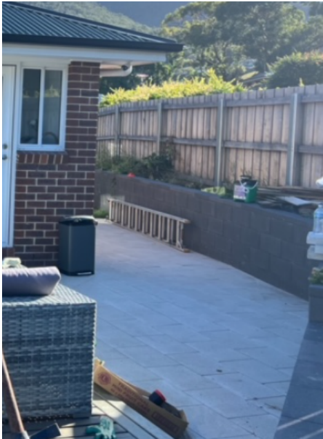
BLOCKWORK LANDSCAPE RETAINING WALL <1000MM

GLENORCHY CITY COUNCIL PLANNING SERVICES APPLICATION No ..... PLN-25-231 DATE RECEIVED ..... 19-08-2025