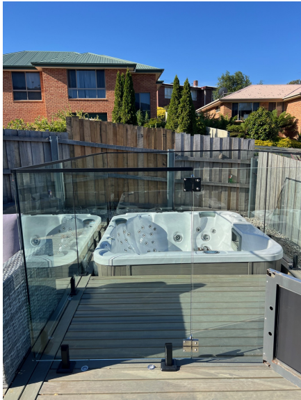
POOL FENCING TO HOT TUB PERIMETER