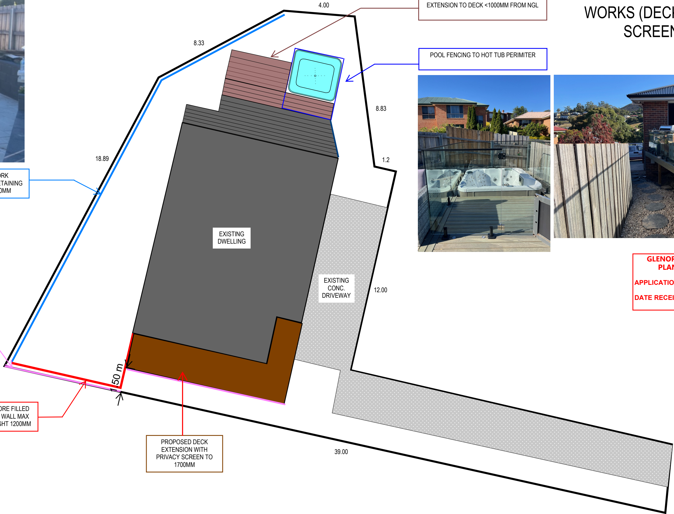
PROPOSED DECK EXTENSION WITH PRIVACY SCREEN TO 1700MM

4a Taree Street, Chigwell PLANNING PLAN SET_REV 0 CLIENT: ZAC DERRICK & AMBER ALLEN